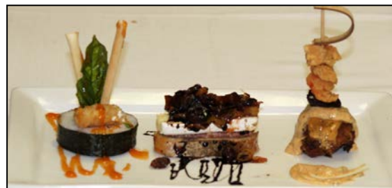
Rockefeller Refuge Alligator Sushi Roll Bruschetta Italiana Crawfish Imperial